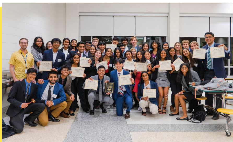
GSMUN students at W&M's High School Model UN competition in November 2023.